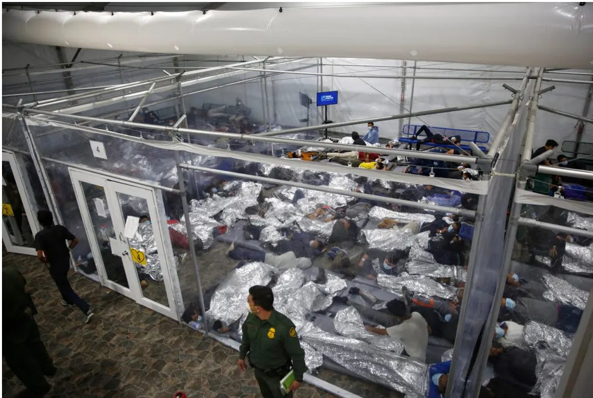
A detention site in the Rio Grande Valley in March 2021. The Biden administration has faced pressure to move unaccompanied children through the system quickly.

His agency began paring back protections that had been in place for years, including some background checks and reviews of children’s files, according to memos reviewed by The Times and interviews with more than a dozen current and former employees.