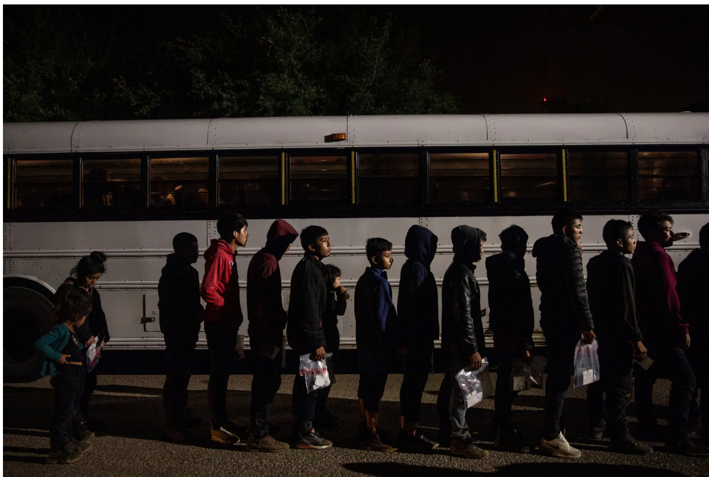
Children being processed by the U.S. Border Patrol in Roma, Texas. In the past two years alone, 250,000 unaccompanied minors have come into the country.