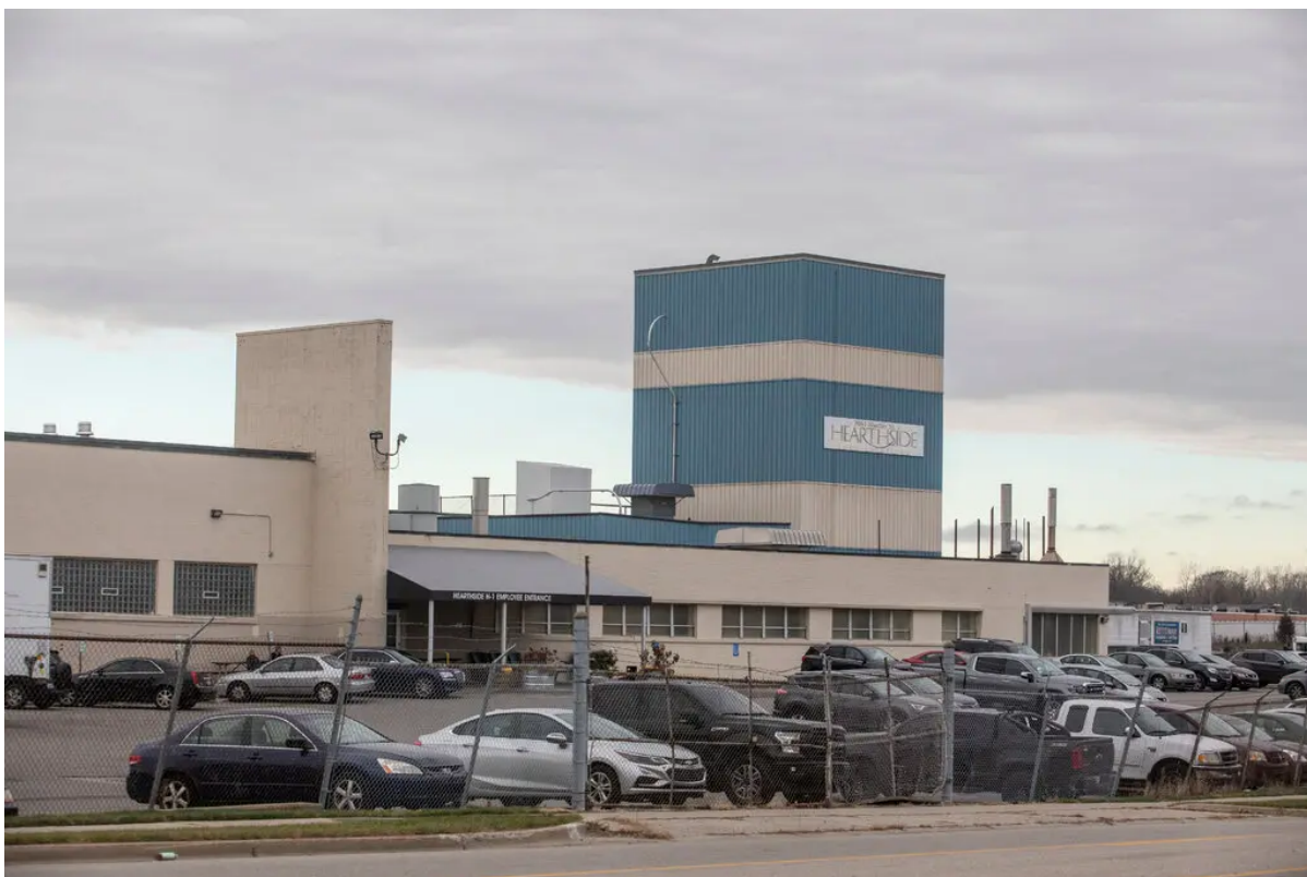
Hearst Food Solutions, one of the United States’ largest food contractors, makes and packages products for well-known snack and cereal brands.