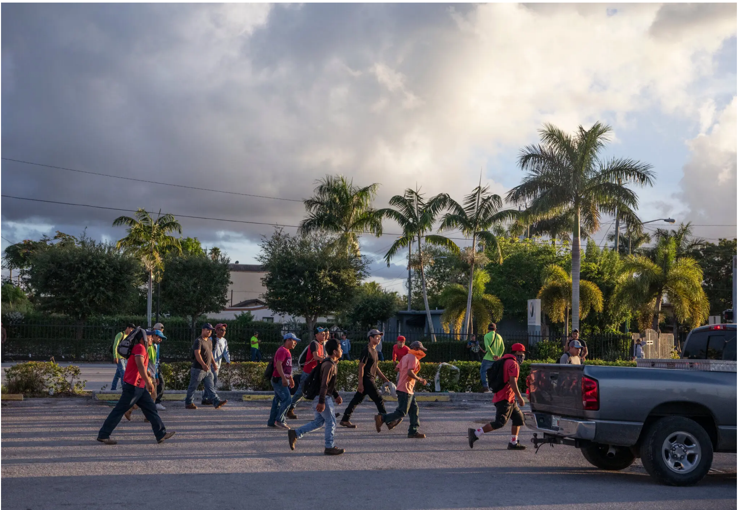
Migrant children were among the day laborers who gathered on a school day in Homestead, Fla., to find roofing, landscaping or other work.

While many migrant children are sent to the United States by their parents, others are persuaded to come by adults who plan to profit from their labor.